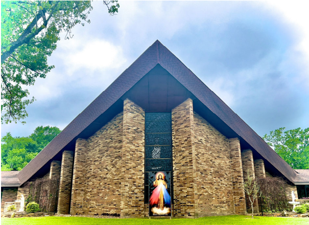
St. Joseph the Worker 804 S. Cleveland St., Dayton, Texas

Mission Statement We are a Roman Catholic community united by faith in God, nourished by Jesus through both the Word and the Eucharist and empowered by the Holy Spirit. We strive to meet the spiritual and physical needs of our growing parish family and community through prayer, faith formation, evangelization, stewardship, fellowship and social justice.