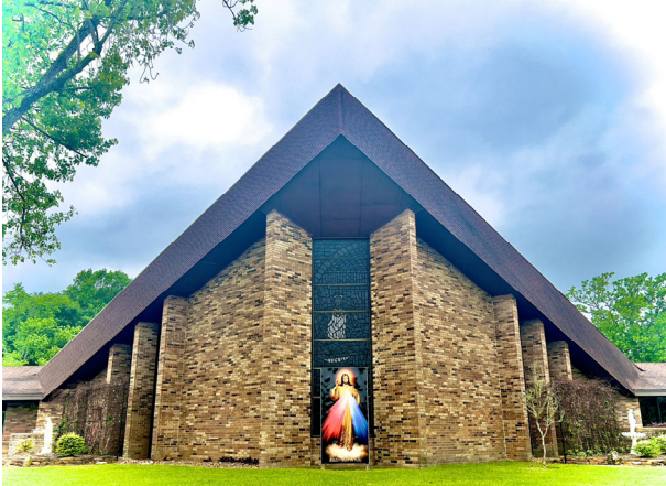
St. Joseph the Worker 804 S. Cleveland St., Dayton, Texas

Mission Statement We are a Roman Catholic community united by faith in God, nourished by Jesus through both the Word and the Eucharist and empowered by the Holy Spirit. We strive to meet the spiritual and physical needs of our growing parish family and community through prayer, faith formation, evangelization, stewardship, fellowship and social justice.