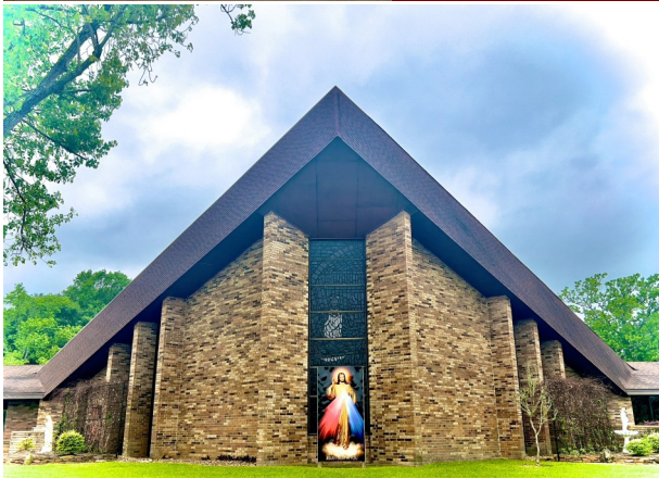
St. Joseph the Worker 804 S. Cleveland St., Dayton, Texas