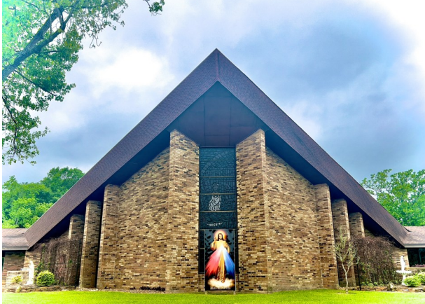
St. Joseph the Worker 804 S. Cleveland St., Dayton, Texas

Mission Statement We are a Roman Catholic community united by faith in God, nourished by Jesus through both the Word and the Eucharist and empowered by the Holy Spirit. We strive to meet the spiritual and physical needs of our growing parish family and community through prayer, faith formation, evangelization, stewardship, fellowship and social justice.