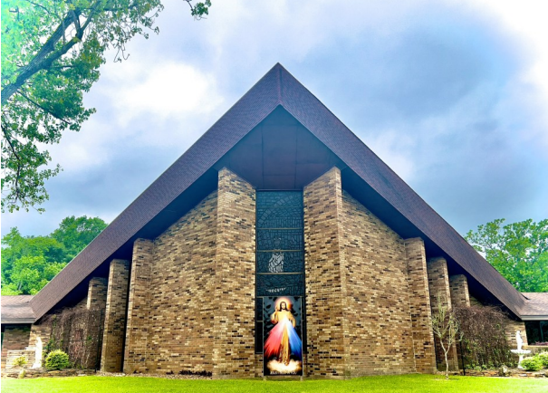
St. Joseph the Worker 804 S. Cleveland St., Dayton, Texas

Mission Statement We are a Roman Catholic community united by faith in God, nourished by Jesus through both the Word and the Eucharist and empowered by the Holy Spirit. We strive to meet the spiritual and physical needs of our growing parish family and community through prayer, faith formation, evangelization, stewardship, fellowship and social justice.